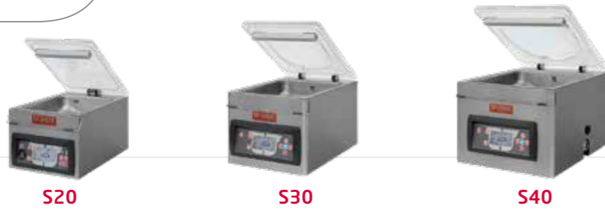
Table Top Range